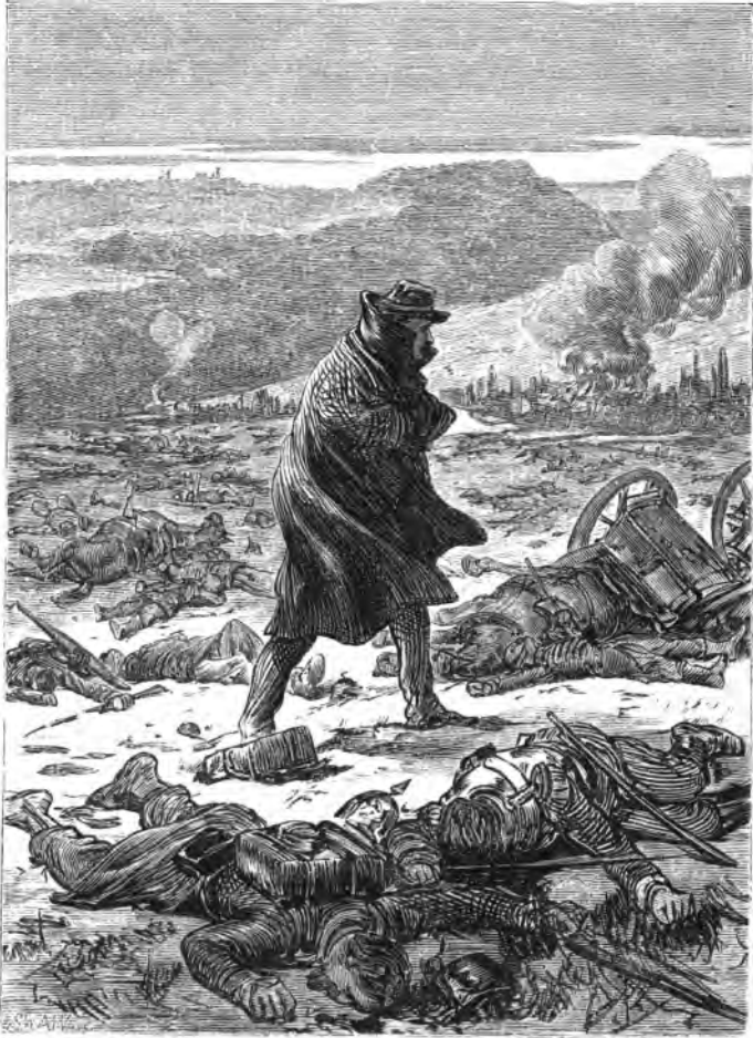
After the Battle.— Page 338.